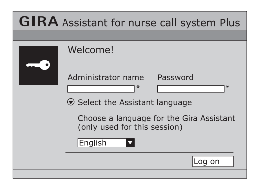
Fig. 2: Start screen of the system central control unit

The start screen of the configuration assistant opens.